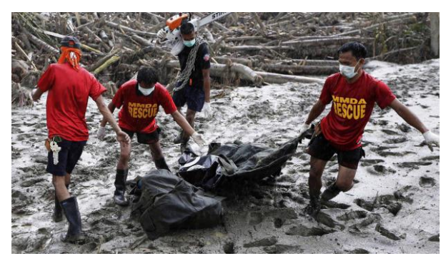
Rescuers retrieve bodies of flash flood victims after Typhoon Bopha, in the remote New Bataan township, Compostela Valley in southern Philippines, Dec. 7, 2012.