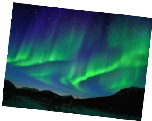
The Aurora; the northern light