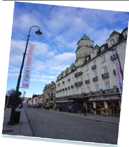
Picture of street in Norway