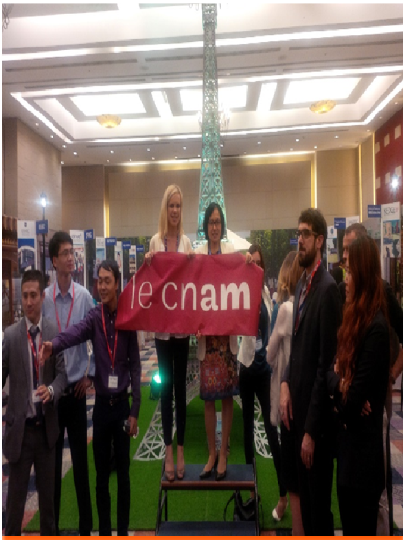
Representing CNAM at an Education Fair