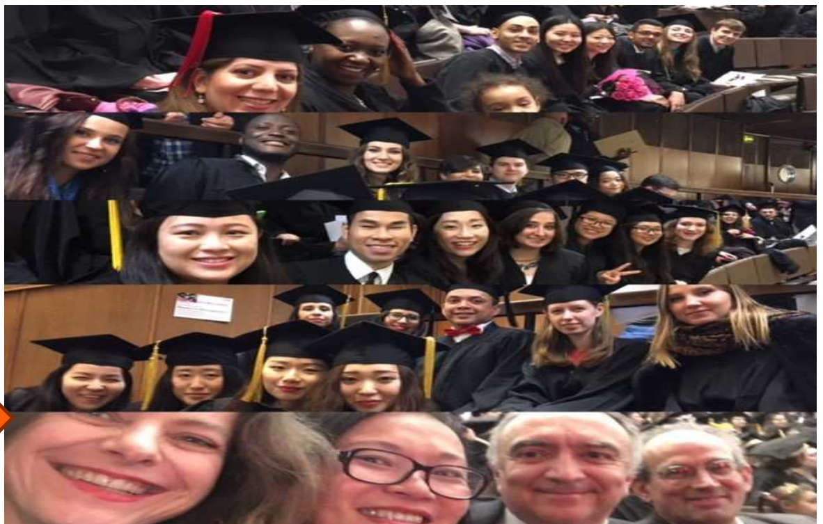
Graduation ceremony MIM 2014-2015