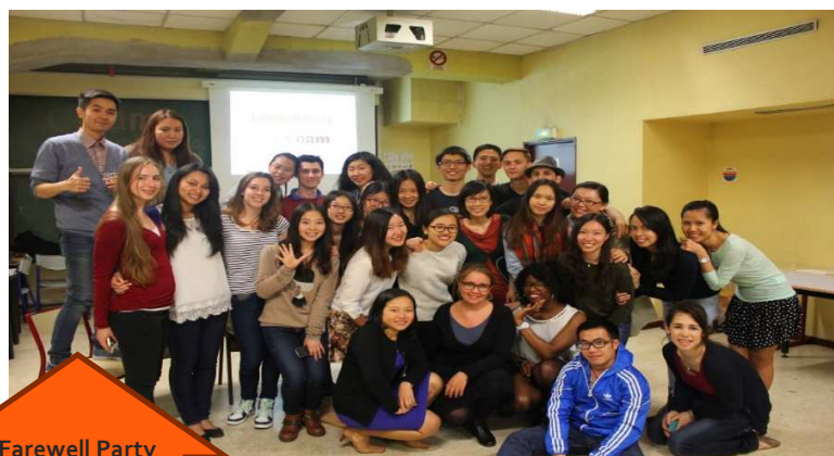
Farewell Party of MIM