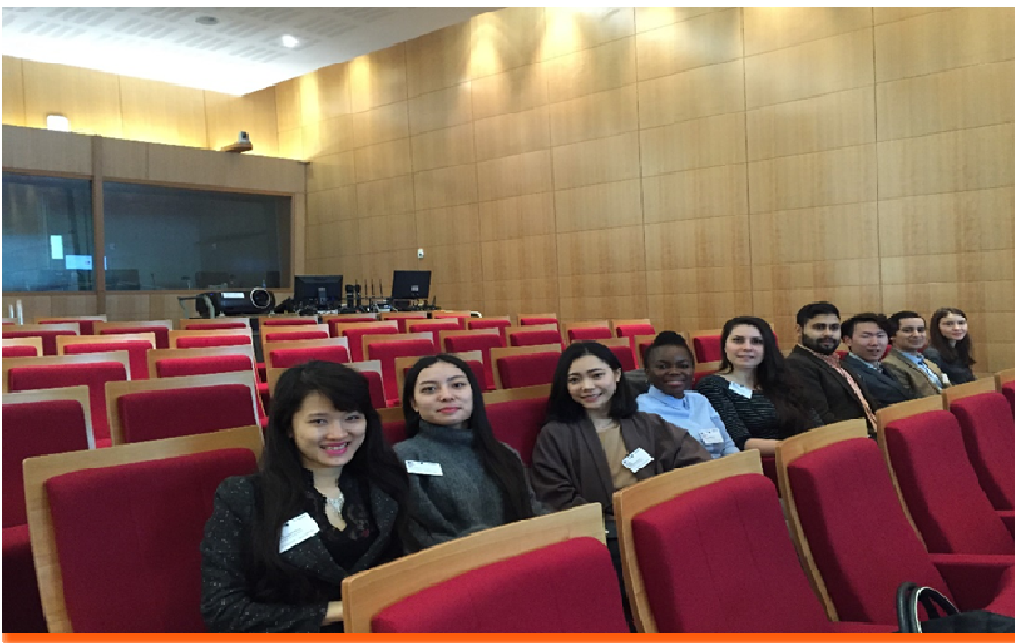
Those in attendance form left to right