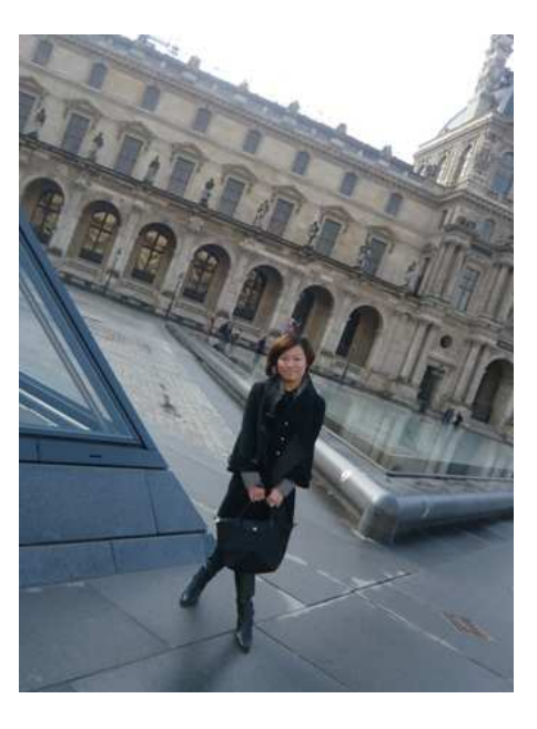
GOOD LUCK ON YOUR FUTURE