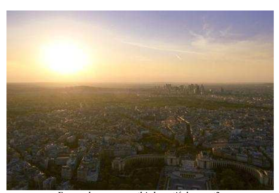
From where can we this beautiful sunset?